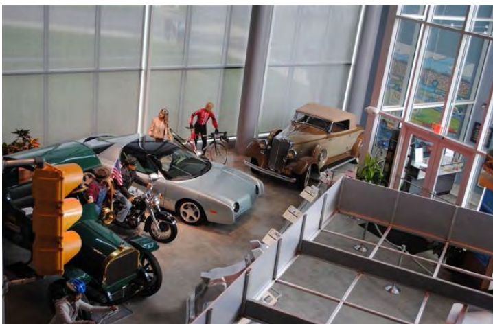
Museum Entrance from Above