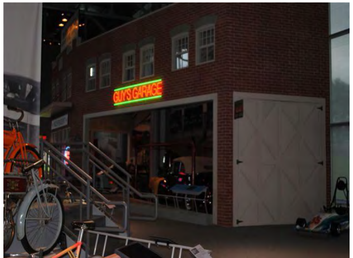
Full Size Repair Shop from the 1940's