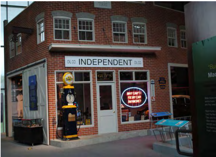
Full Size Replica Filling Station