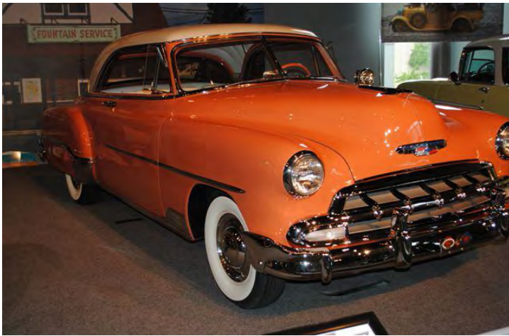
Nice early Bel-Air