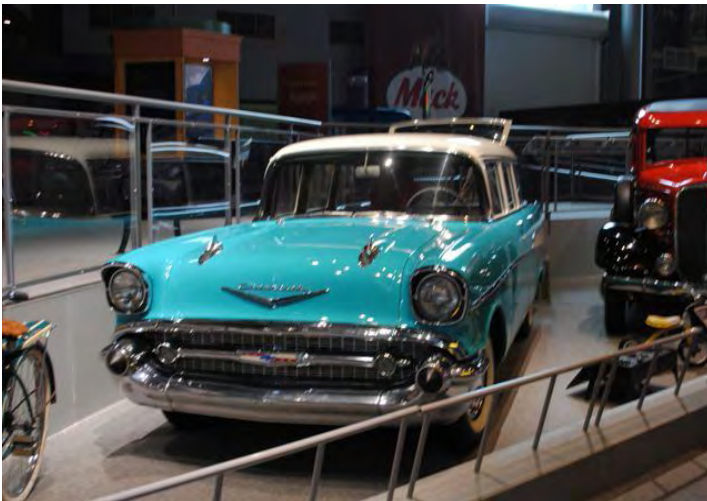
Nice '57 four door station wagon