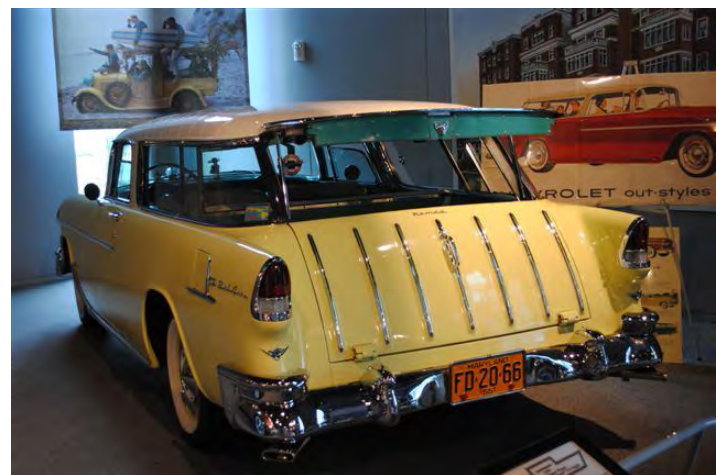
Spectacular '55 Nomad