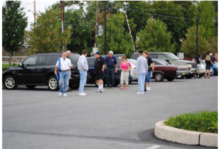
Arriving at Museum

Pennsylvania and then proceeded along the back windy roads north to Allentown and the museum. Twenty six folks attended in five Corvettes to join the 70 mile trip. A special thanks goes out to those who drove their Corvettes. I know you had to do a lot of washing to get them clean after the tour.