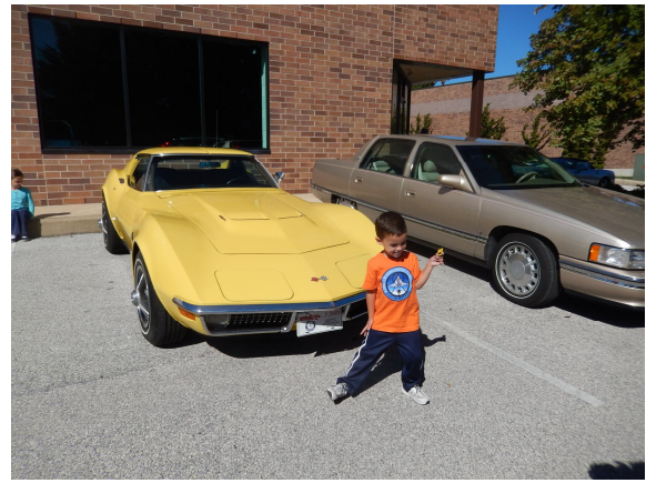
Future NCRS Judge