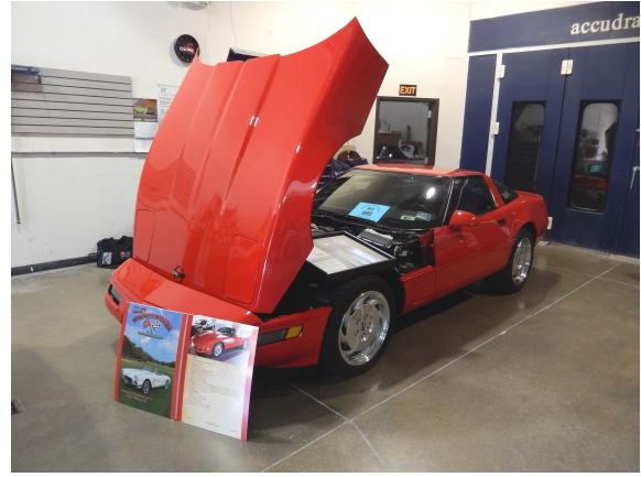
Pat Fullam's 1995 Display