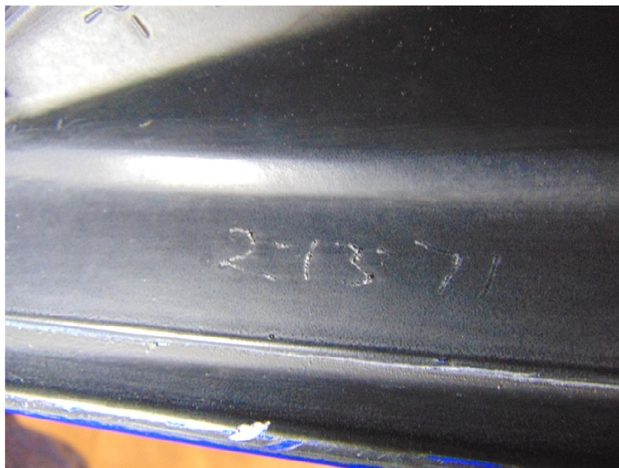
Another 1996 hood etched on February 13th, sequence number 71.