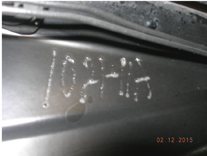
1992 Corvette showing the date 10-21-91 shift A