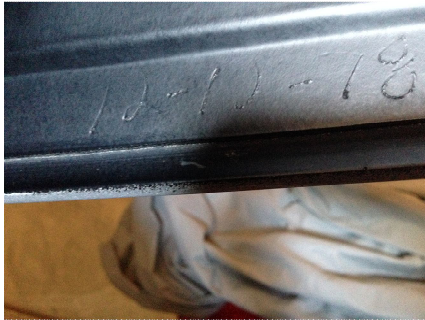
Here is an etching from a 1995. The hood was etched on December 12th and contains a sequence number of 78. Note the formation of the numeral 8.