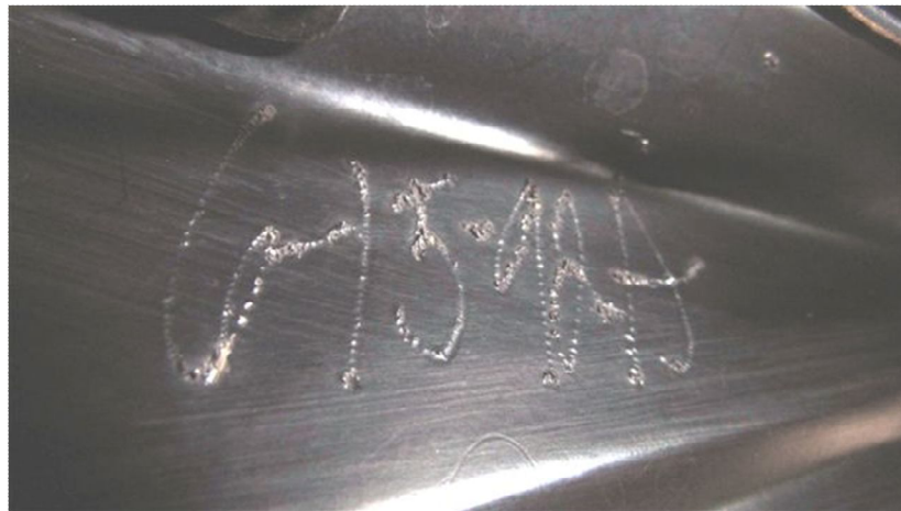
Another 1992. The build date for this Corvette is June 15th 1992 shift A